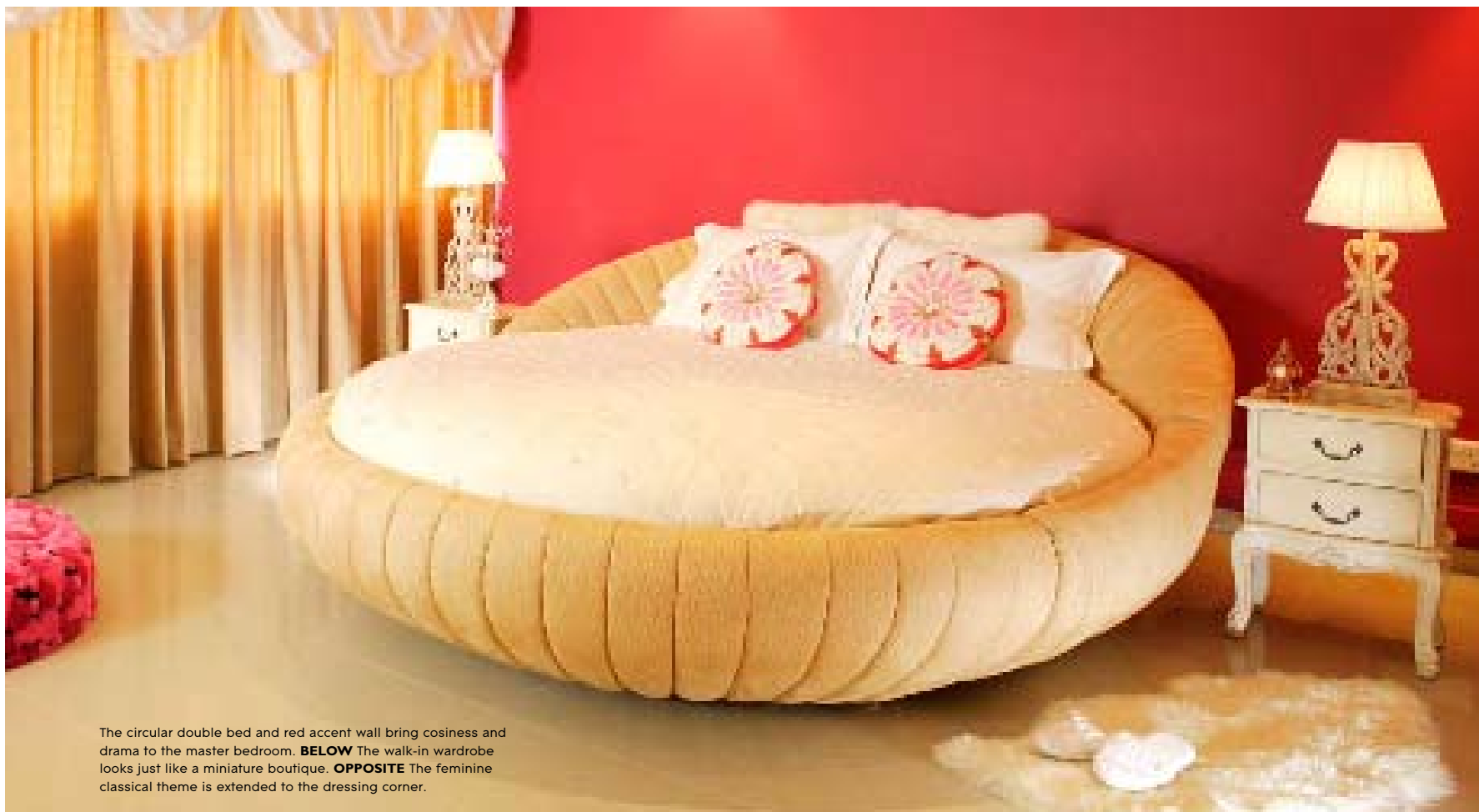
The circular double bed and red accent wall bring cosiness and drama to the master bedroom. BELOW The walk-in wardrobe looks just like a miniature boutique. OPPOSITE The feminine classical theme is extended to the dressing corner.

To avoid a dated, over-the-top look, the classical furnishings are balanced by modern touches: A test-tube vase shares space with a white glass chandelier in the living room, while a unique water-filled hanging lamp above the dining table has crystals submerged inside. "There is a really tough balancing act involved in pouring water into the lamp!" reveals Angelina with a laugh.